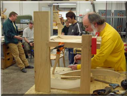
Northern Michigan University