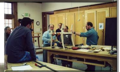
Peninsula Art School